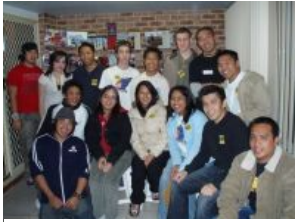
Go National Canberra