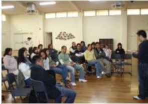
Go National Melbourne