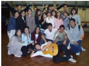
Go National Brisbane